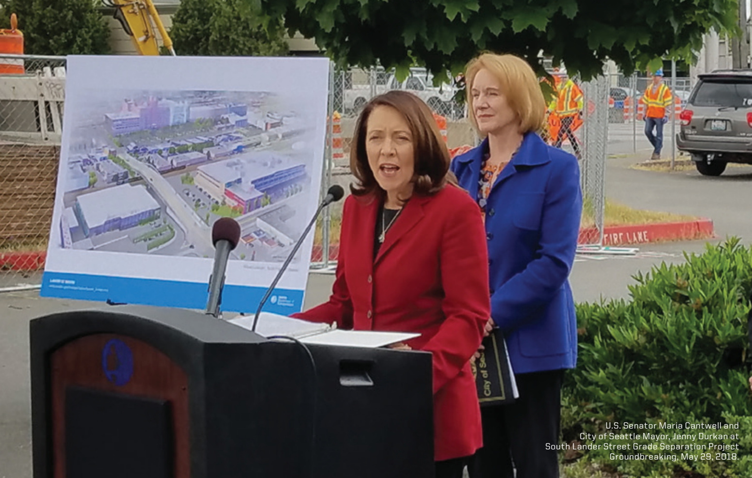
U.S. Senator Maria Cantwell and City of Seattle Mayor, Jenny Durkan at South Lander Street Grade Separation Project Groundbreaking, May 29, 2018.