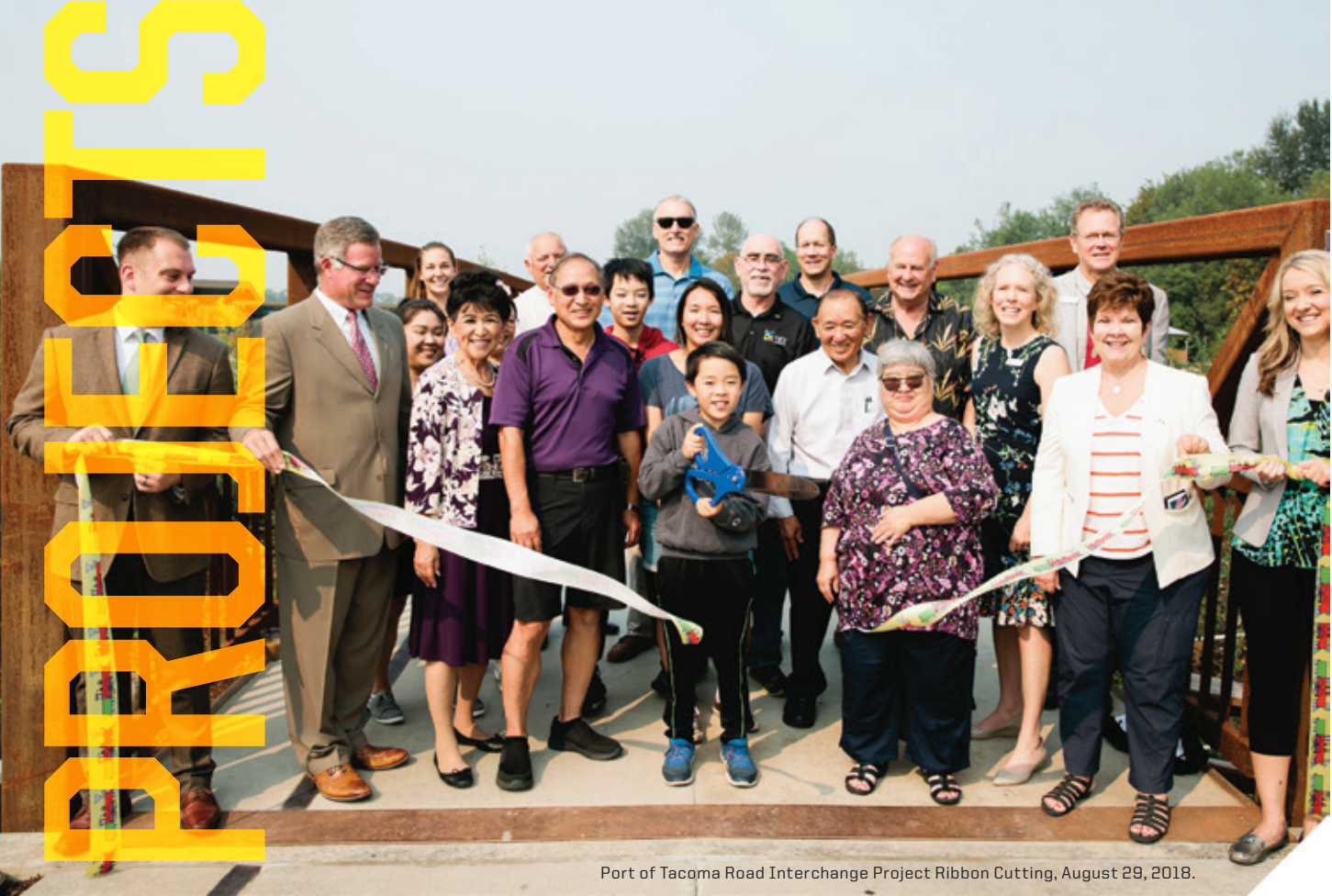
Port of Tacoma Road Interchange Project Ribbon Cutting, August 29, 2018.

Since 1998, FMSIB has leveraged its $318 million contribution with partnership funding to achieve $2.1 billion in freight transportation system investments. FMSIB staff and board members have also provided leadership and technical assistance to facilitate project partnerships, to undertake special studies that advance the state's freight policy, to reduce impacts on communities from freight movement, and to encourage system efficiencies that can keep the state economically competitive.